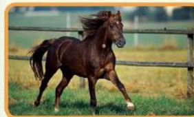
This is a Welsh Cob.