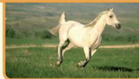
This is an Arab horse.