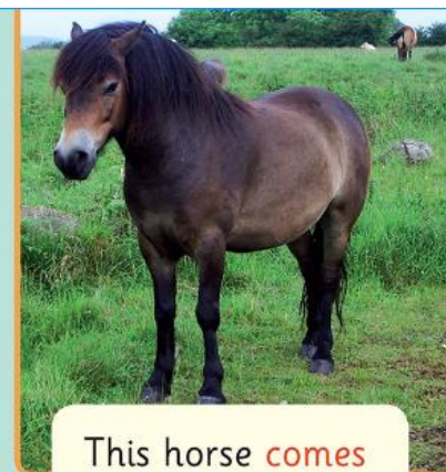
This horse comes from Exmoor.