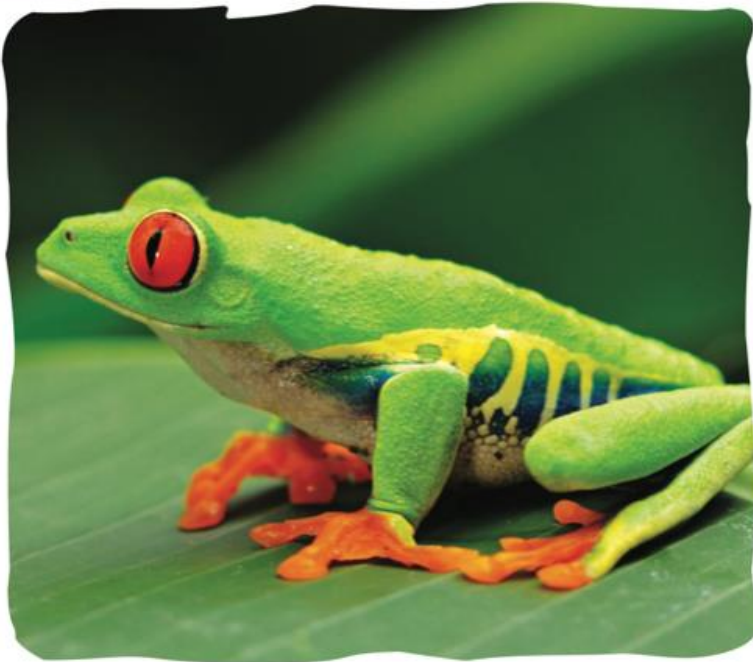
▲ The red-eyed tree frog.