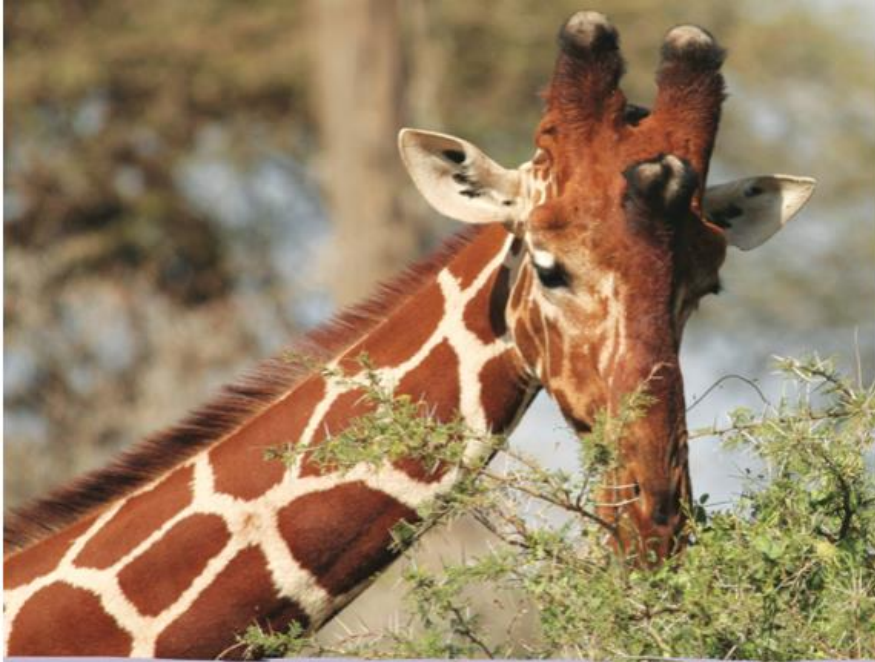
▲ Giraffes mainly eat leaves and twigs.

The giraffe spends a lot of time eating. It needs about 35 kilograms of food each day. That is more than you eat in one month! The giraffe does not need to drink very much. That's because it gets lots of water from all the leaves that it eats.