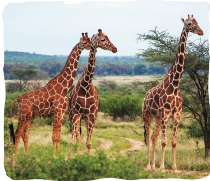
▲ A tower of giraffes.

The giraffe spends a lot of time eating. It needs about 35 kilograms of food each day. That is more than you eat in one month! The giraffe does not need to drink very much. That's because it gets lots of water from all the leaves that it eats.